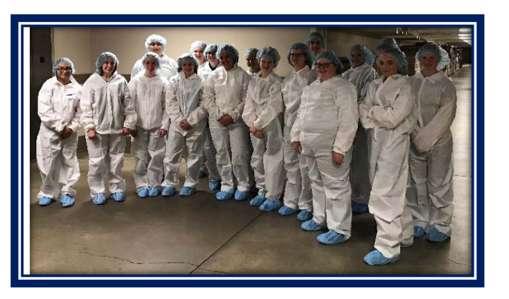
Sanford Youth Medical Explorers (YME) visit Sanford Surgical Services

https://www.sanfordhealth.org/about/academicaffairs/career-exploration